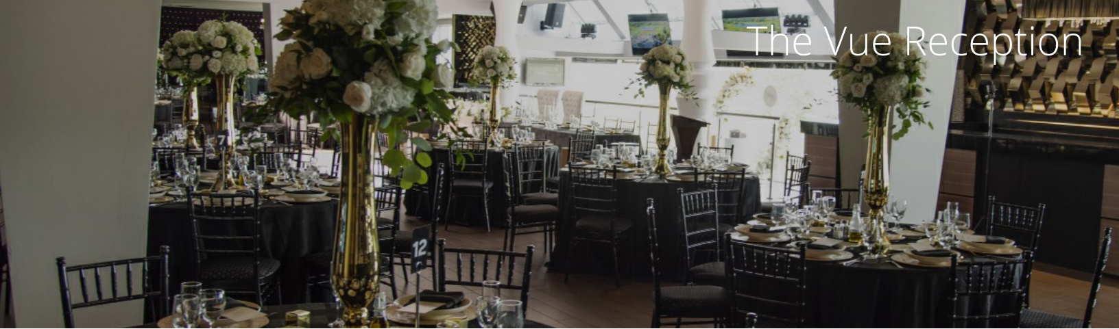
The Vue Reception